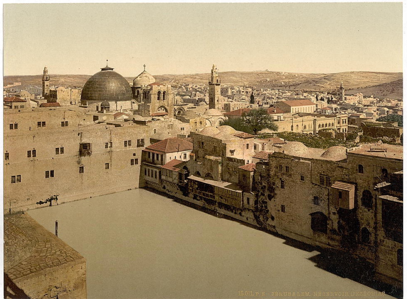
Pool of Hezekiah