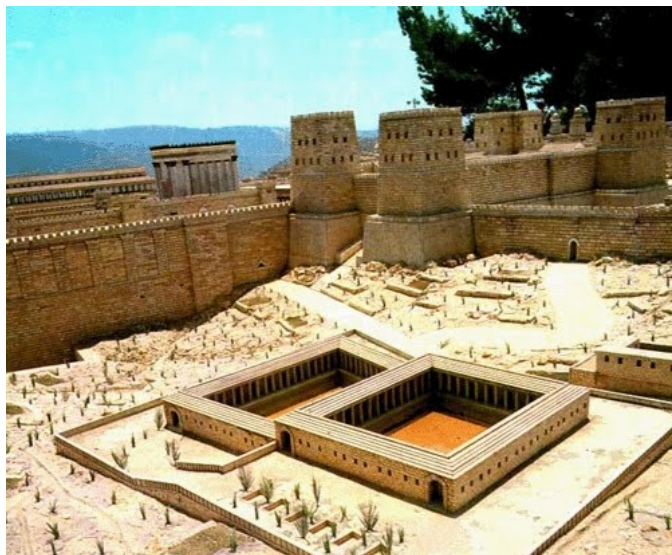
Model of Pool of Bethesda