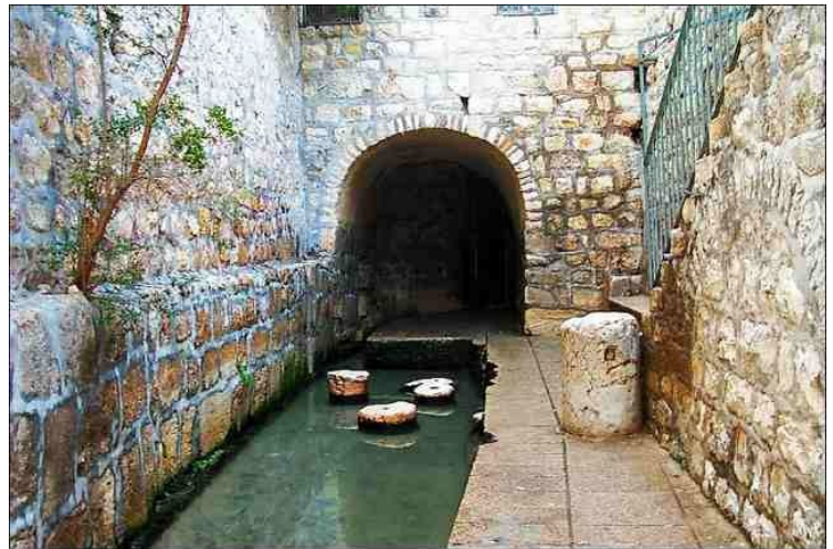
Pool of Siloam

A cattle market at the Lower Pool of Gihon (Ca. 1900)