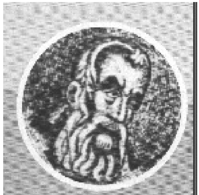
Athanasius of Alexandria

Athanasius of Alexandria (298-373) recognized the exact canon we do and was, “perhaps the first to apply the term canonical to the exact twenty-seven books that we now have in our New Testament.” (7b)