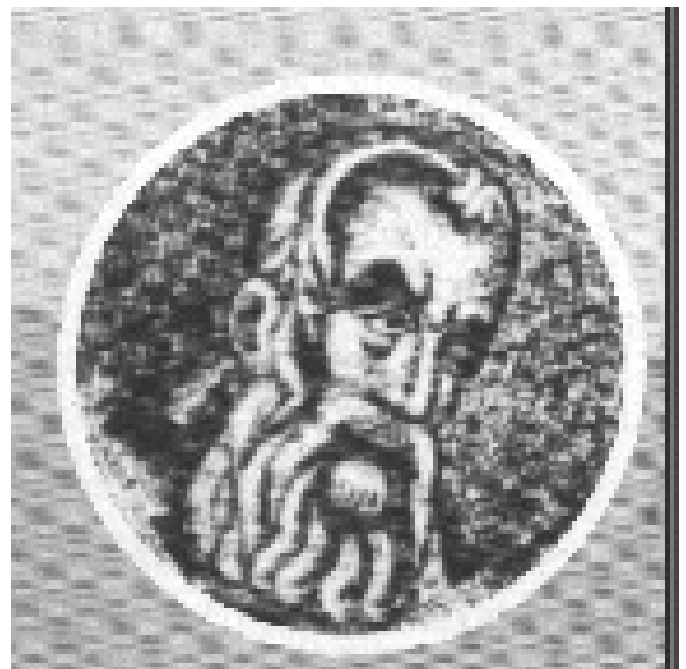
Athanasius of Alexandria

Athanasius of Alexandria (298-373) recognized the exact canon we do and was, “perhaps the first to apply the term canonical to the exact twenty-seven books that we now have in our New Testament.” (7b)