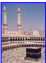
The Kaaba at Mecca.

The Vision - According to Islamic tradition, sometime after his fortieth birthday Mohammed was alone on Mount Hira, which is near Mecca, meditating; this was during the month of Ramadan. Suddenly, an angel appeared to him and commanded him to “recite” in the name of God. Failing to respond, he was then grabbed by the throat and shaken by the angel as it continued repeating the command. When this brought no obedience by Mohammed, the angel continued throttling him until Mohammed finally, in desperation, did as he was told to prevent being choked to death. Islam was to spring from that time of visions, beginning with that “Night of Power;” (24) and Mohammed was to be the chosen prophet and began writing down a series of revelations over the next 22 years that make up the Koran, which is the chief holy scripture of Islam. From the beginning Mohammed himself, however, doubted the visions and his call and even feared for his sanity. At times he even feared that he was possessed by an evil spirit. When the revelations resumed after a 2 year gap, which in itself added to his doubts and tradition says just as he was about to commit suicide, the revelations resumed. It was only then that he accepted his being chosen as the prophet of Allah.