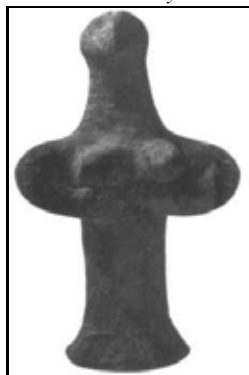
Fertility figurine ca. 7th-6th century B.C

The typical early fertility goddess can be seen to the left. The motherhood is accentuated by the over-large paps and the lack of detail in the rest of the goddess.