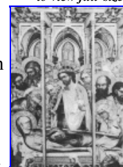
"The death of the Virgin." c. 1360 Click picture to view full-sized.

NOTE: The Roman Catholic doctrine of worship of Mary must also be included in this category and must be mentioned since Roman Catholicism is such an important and wide-spread cult. They would deny that Mariolatry is worship of the dead, since they believe in the doctrine of the “bodily assumption” of Mary which teaches that she is bodily alive in heaven today.