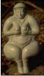
Inanna, Sumerian Queen of Heaven.