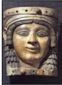
Ishtar, Babylonian Queen of Heaven.

Far right is the Isis with Horus madonna; middle is the Mary with Jesus madonna; leftmost of the three is the Demeter with Persephone madonna.